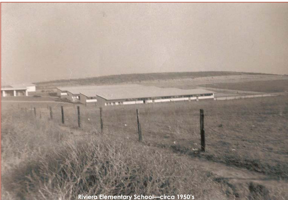
Riviera Elementary School—circa 1950’s